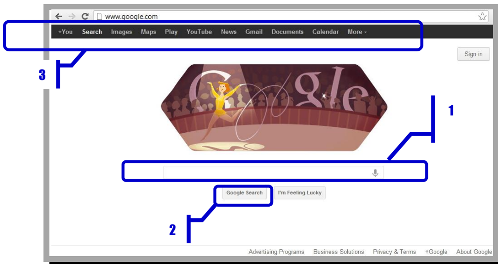
Figure 1. The Google User Interface

Google's "free" and easy-to-use Internet search service begins with a very familiar user interface (or home page). Using a web browser such as Google Chrome®, Mozilla Firefox®, Internet Explorer®, or Safari®, the web address, www.Google.com , is entered as shown in Figure 1. By entering a keyword (or phrase) in the search box (section 1) and clicking the "Google Search" button (section 2), a basic user-initiated search can be requested. In addition to using the Google home page to search relevant results on the World Wide Web, users are also able to perform specific searches (i.e., You, Search, Images, Maps, Play, YouTube, News, Gmail, Documents, Calendar, and More) by clicking the links located at the top of the Google page (section 3).